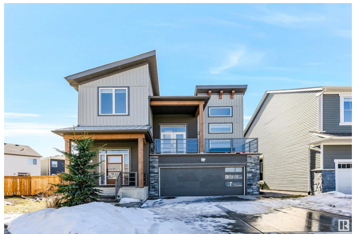
1603 202 St NW, Edmonton, AB