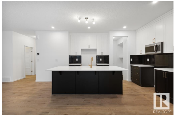
37484026 – Interior Selection Photo – Main Floor

MLS® # E4428135 Price $647,990 Bedrooms 4